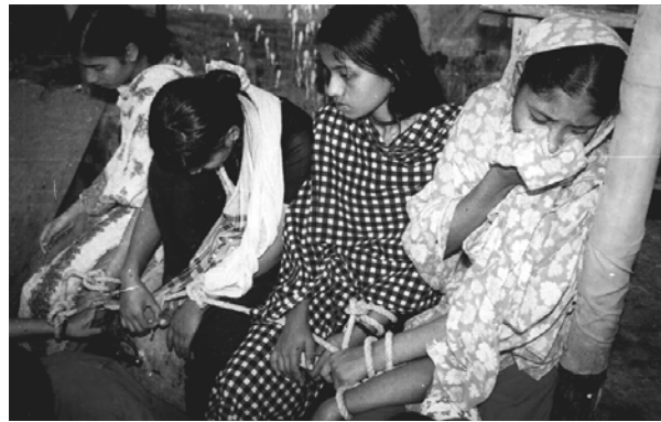
Photo: Textile workers in Bangladesh were beaten and tied with rope after speaking out for their rights.

Senator Byron Dorgan (D-ND) and Representatives Mike Michaud (D-ME) and Chris Smith (R-NJ) introduced landmark USW-backed legislation. This bill, the Decent Working Conditions and Fair Competition Act (S. 367 & H.R. 1992), will ban sweatshop goods from entering our markets. The bill also prevents our government from purchasing sweatshop goods with our taxpayer dollars.